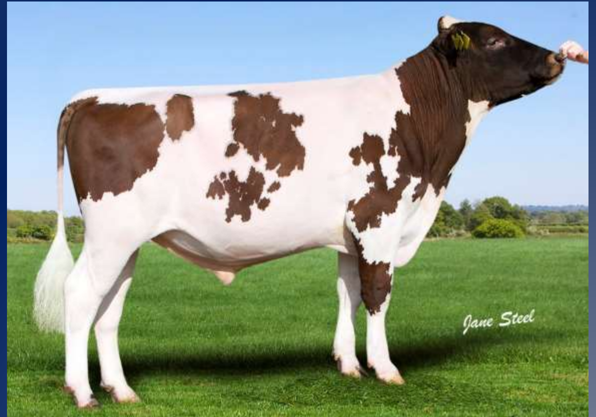
Sandyford Time Lord

UK Bred Bulls sourced and proven on UK Farms