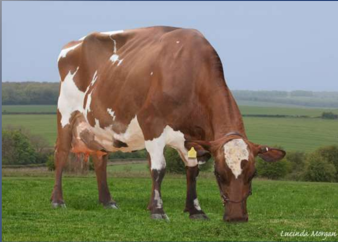
Dam Bailiffscourt Hortense 267 EX93 2E